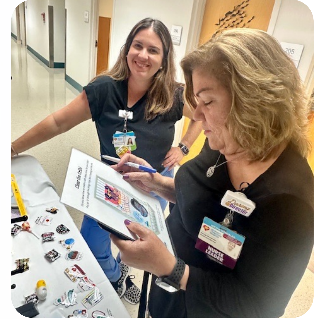
Nursing Compliance of Caregiver Education on Safe Sleep Prior to Discharge from NICU